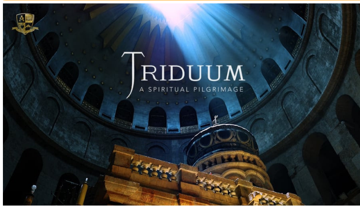
Triduum: A Spiritual Pilgrimage

This beautiful, 30-minute contemplative documentary walks through the locations of the Holy Week story, re-presenting the most important days of human history. Immerse yourself in the Holy Land to draw nearer to the Passion, Death, and Resurrection.